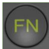
Figure 3: Data Logging Via FN Button

Start and Stop data logging directly on the TRIUMPH-1M PLUS with the FN button (Figure 3).